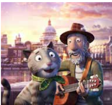
Tabby McTat , on BBC One this Christmas

For my fifth birthday, my father gave me a very fat book called The Book of a Thousand Poems . I loved it. I read the poems, recited them, learnt them, and then started making up some of my own. Although I wanted to be a poet all those years ago, I later decided I would rather go on the stage. That didn't quite work out, so I did other jobs – teaching and publishing. But somehow I've ended up doing what I wanted to do when I was five years old. I have a theory that this happens to quite a lot of people.