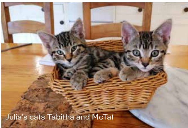
Julia's cats Tabitha and McTat

When I was a songwriter I used to write lots of adults' songs and sing them in folk clubs, but it was the children's ones that there was a market for, on radio and TV. I was probably drawn to picture-book writing because I had so much experience of writing short things in rhyme (the songs). The books weren't intended for my own children but were probably influenced by the happy hours I'd spent reading to them when they were smaller.