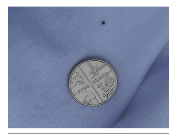
Figure 4: Ixodes tick nymph