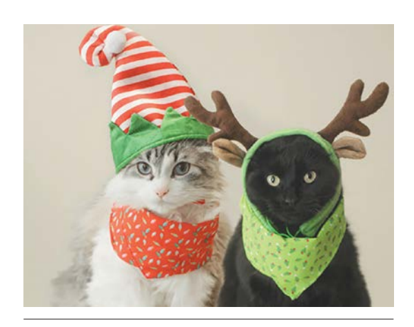
Figure 2: Playing dress-up is certainly not part of the cat's ethogram