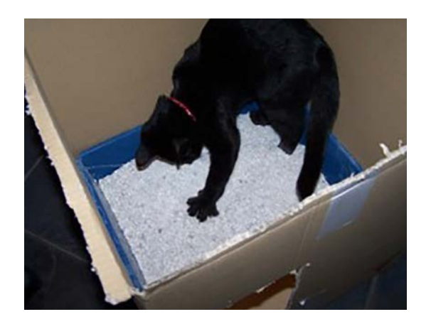
Creating a litter tray in cardboard box

Recent research found that cats have a preference for covered litter trays over open ones (Beugnet and Beugent, 2019b), however it was noted that they also preferred ones with a larger surface area. Some covered litter trays are a bit too small for larger adult cats to be able to get into and comfortably turn around in. A cheaper alternative is to put a cardboard box over the top of a large open tray (picture) to provide the cat with some privacy but without it being too enclosed.