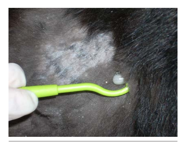
Figure 3: Removal of tick with tick hook