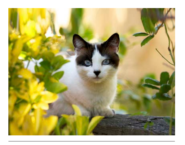
Studies confirmed that ticks were found on cats throughout the year but with seasonal peaks through the spring, summer and autumn.

Ticks should be removed with a tick removal device (fig 3.) or fine pointed tweezers. If tweezers are used the tick should be removed with a smooth upward pulling action. If a tick hook is used, a simple "twist and pull" action is employed. It is important that ticks are removed without stressing them. Squashing or crushing ticks in situ with blunt tweezers or fingers will stress the tick leading to regurgitation and emptying of the salivary glands, potentially leading to increased pathogen transmission. Traditional techniques to loosen the tick such as the application of petroleum jellies or burning will also increase this likelihood and are contra indicated. There will also be a very limited window of opportunity with most cats to remove the tick so delay should be avoided! Nymphs are very small (fig 4) and can be difficult to spot in cats, especially if the coat is long. Data from the tick surveillance scheme suggests that ticks are more likely to be present around the head and neck so in fractious cats, this is where examination for ticks should be concentrated (Wright et al, 2018).