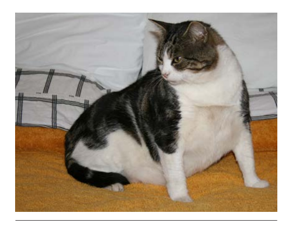
Figure 1: Obesity may be more prevalent in cats with indoor access only