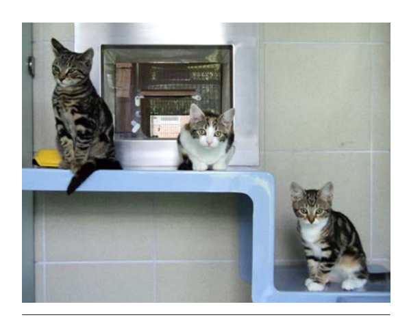
Ledges provide access to the cat flap, but also serve as a perch

Having an appropriate number of litter trays is often overlooked, especially in multi-cat households. The golden rule for resources in a multi-cat household is one per cat plus one extra. Despite this the PDSA PAW report found yet again in 2019 that a large percentage (67%) of owners with two or more cats are only providing one or no litter tray, a trend which has increased from 2011 when the first PAW report was conducted. Providing the right number of litter trays can help with inappropriate urination as there is less opportunity for resource blocking and some cats won't use a litter tray if their companion has already used it (Ellis et al, 2017).