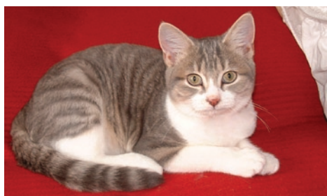
Tiggy was rehomed after being found living with 20 other cats in squalid conditions

At any one time we have more than 6,500 cats in our care