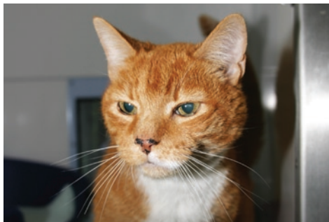
Thanks to your support we helped to neuter 98,112 cats across the UK

With your continued support Cats Protection neutered 1,000 more cats in 2006 than in 2005 and a further 32,000 cats were microchipped. Naturally, our branches were at the forefront of this work and our Preston and Atherton & Wigan Metro Branches helped neuter nearly 2,000 cats each. Our branches in the Hertfordshire area also worked closely together and issued more 1,300 neutering vouchers to cat owners in the district. 2006 saw a major review of our neutering activities and a dedicated Campaigns Department was formed. It has already set about revitalising existing Cats Protection voucher schemes and giving more support and resources to branches and vets, making it easier to organise and administer local campaigns.