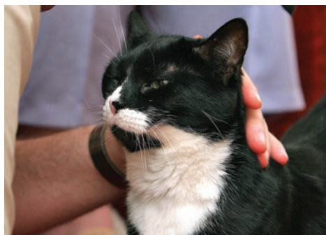
Winner of Rescue Cat of the Year 2006, Tee Cee, with his life saving talents