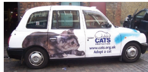
One of the 5 taxis emblazoned with the Cats Protection's logo and contact details

Cats Protection often leads the way when it comes to increasing awareness in innovative ways. In 2006 we became the first animal welfare charity to advertise on taxis. Five cabs, emblazoned with the Cats Protection logo and contact details, hit the streets of London, Glasgow, Newcastle and Birmingham. Plus, our 'Come and Get Frisky' advertising campaign in railway stations was seen by tens of thousands of people.