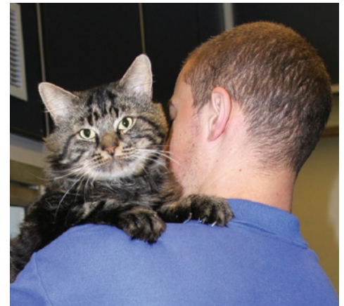
We rehomed and reunited 55,500 cats and kittens in 2006

Into the future: Rehoming cats is at the heart of what we do and we are working now to ensure many more cats in the future are given that loving home they deserve.