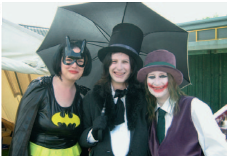
A Batman-themed Open Day raised over £2,000 for our Bridgend Adoption Centre

and Andy Murray up for grabs, bidding was frenzied with just under £1,000 raised. Two of our main fundraising events, namely The Big Day Out and the Cats Protection Open Day raised a combined total of £11,704. In addition, our ever-popular photographic and writing competitions saw us receive a total of almost £9,000 in accompanying donations.