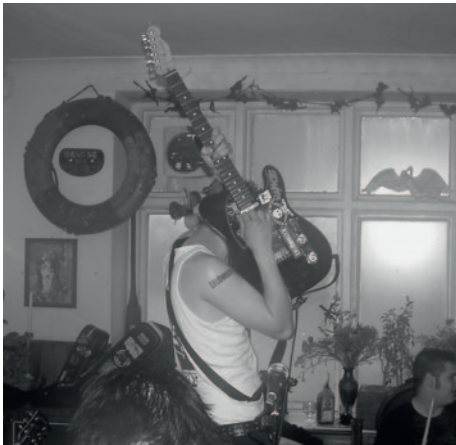
A punk gig in memory of a cat-loving punk fan raised £500 for Cats Protection

2009, the story so far Four members of CP staff donned cat costumes for an online video to raise awareness of the importance of neutering. The fun one-minute film shows cats playing football with a non-existent ball before the slogan: "You don't need balls to have fun... get your cat neutered!" is revealed. At the time of writing, the video had received over 5,000 views on YouTube as we got an important message across in a light-hearted way.