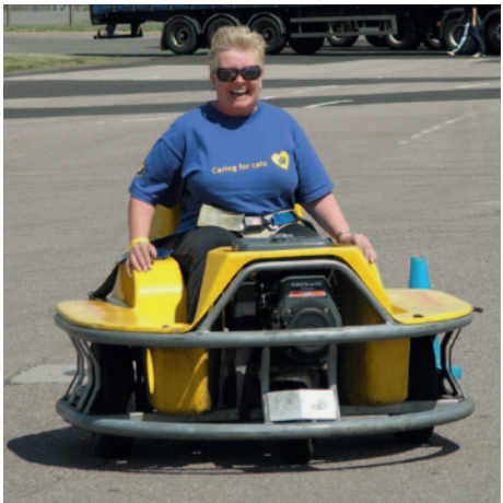
One of the year's many fundraising events saw supporters driving weird and wonderful vehicles

Things are also progressing well in other areas including our arrangement with mobile phone recycling experts, Greener Solutions, which raised over £6,000 in its opening three months. We have also commenced work with Argos and will increase awareness and funds as a result of appearing in its catalogues and on its website.