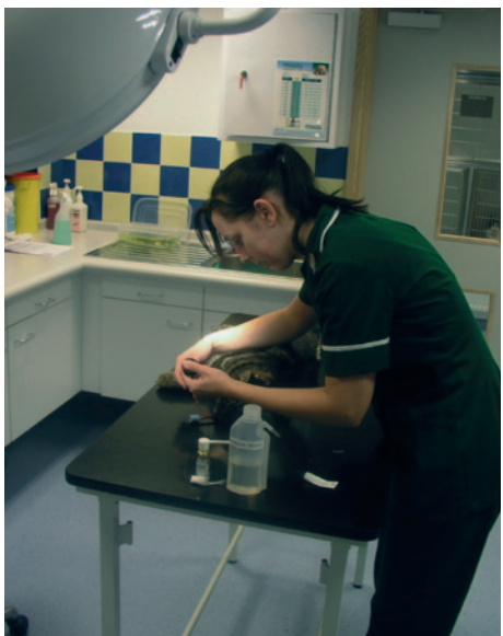
Our Veterinary Department had another busy year, starting with the introduction of our Minimum Veterinary Standards

2009, the story so far In April, we attended the British Small Animal Veterinary Association (BSAVA) Congress, giving us the opportunity to meet thousands of vets and veterinary nurses and promote our aims and objectives.