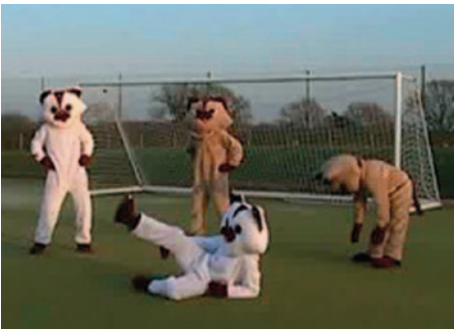
Four of our staff limber up for the successful online video to promote neutering

In total, we gave 20,916 feral cats a brighter future; a figure which meant we increased our neutering work with ferals by 62 per cent. We also microchipped 34,800 pet cats in 2008.