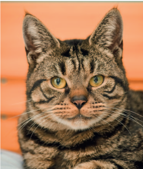
The winner of our Rescue Cat Awards, Speedy