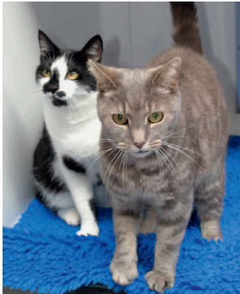
Cats Protection rehomed and reunited 55,056 cats and kittens in 2008

2009, the story so far In April, we launched a fundraising appeal to open a new Homing Centre in Ferndown near Bournemouth which could revolutionise the way in which the charity finds new homes for unwanted cats. When it opens, the Ferndown Homing Centre will provide potential owners with the opportunity to meet ready-to-home cats in a comfortable, bespoke environment and it is hoped that it will act as a model for future rehoming activity.