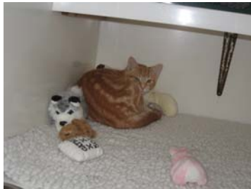
Ginger & Tigger