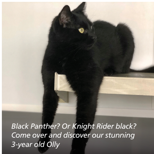
Black Panther? Or Knight Rider black? Come over and discover our stunning 3-year old Olly

Whether they are a 'Rosello red', 'dusky black' or Brewster Green', we believe all shades of black cat are beautiful.