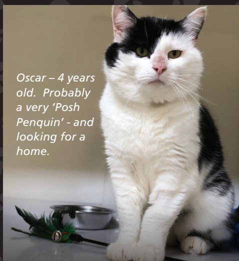
Oscar – 4 years old. Probably a very 'Posh Penguin' - and looking for a home.

Meanwhile here at the Centre, we're celebrating our very own Isle of Wight-and-Black day in honour of the fifty or so beautiful black-and-white cats we currently have in our care. They too have their very own Cats Protection colour chart. Five crazy patterns of black and white - Zebra, Oreo, Dalmatian, Posh Penguin and Cow Patch. Why not come over to the Centre and see for yourself? We're pretty sure you'll find one of each kind here, along with a whole range of colourful personalities, ages and sizes.