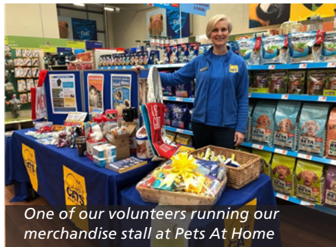
One of our volunteers running our merchandise stall at Pets At Home