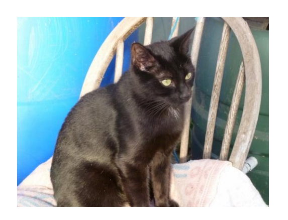
Cleo – 2 years old female

<u>CHRISTMAS CAT FOOD COLLECTIONS</u> - Thank you to everyone who donated cat food to our food bins in Tesco and the Co-op in Castle Douglas. We and the cats really appreciate your generosity.