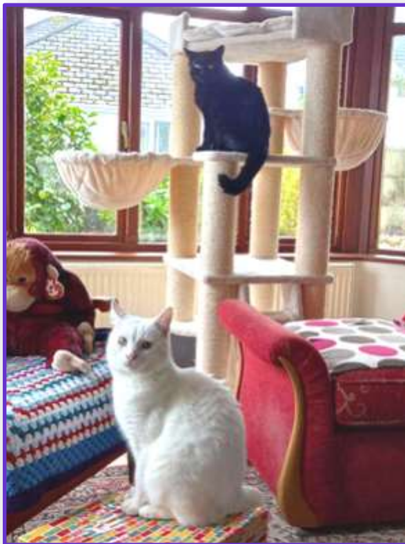
Thor (above) & Alaska below), two FIV positive cats living at peace with one another.