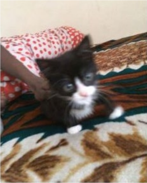
Fig 1.3 Very nice black-and-white kittens £280