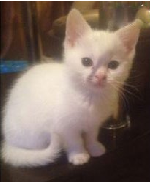
Fig 1.4 Adorable white kitten for sale £300