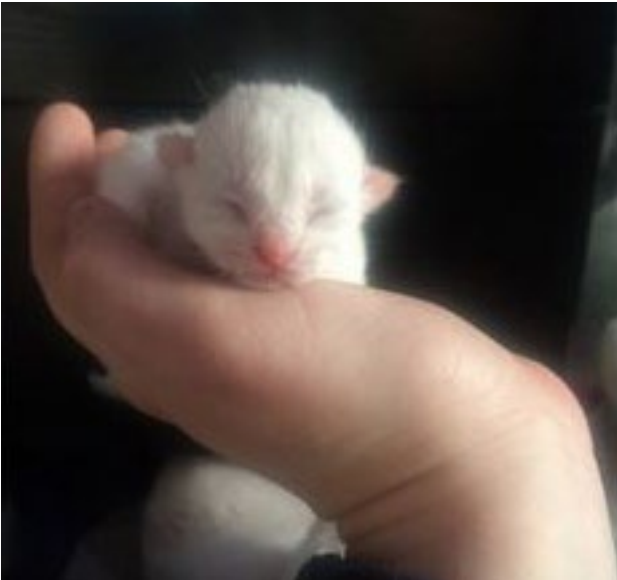
Fig 1.7 Stunning litter of Russian X (only one left) £275