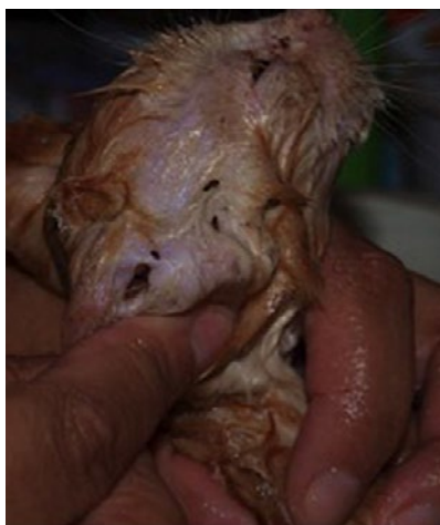
Kitten's head after bathing – flea spray could not be used as the skin was too sore