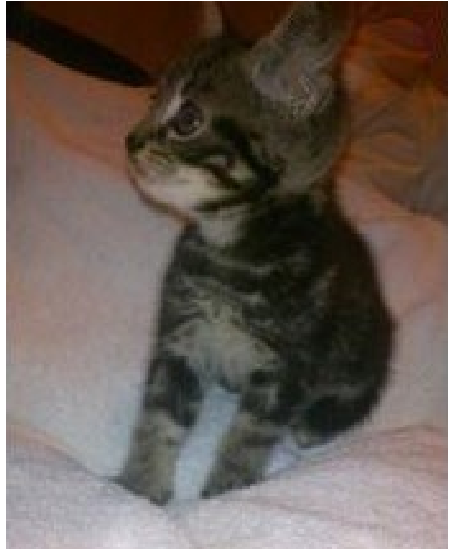
Fig 1.5 Tabby kittens £450