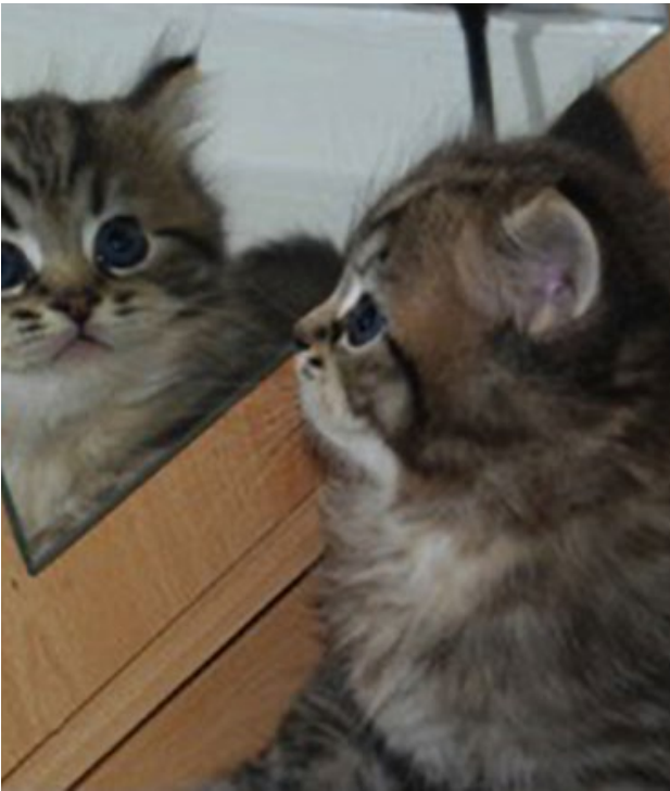
Fig 1.1 Gorgeous kitten for sale £300