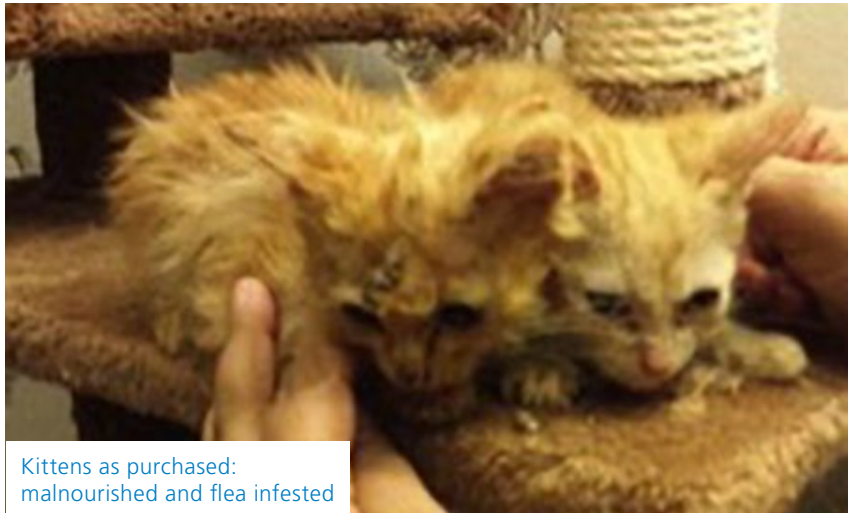
Kittens as purchased: malnourished and flea infested

We were contacted by a lady who had bought two kittens from a person on a Facebook pet selling site for £10 each. She was so shocked by the state that these kittens were in that she realised that she needed help. These two sisters were sold as miniature kittens but really they are malnourished, flea infested, have a massive worm burden, filthy and in the worst condition we have seen kittens come in from a private home in a long time. One may have to have her tail amputated as it is 'crispy' through urine burns and on bathing them (we couldn't use flea spray as their skin is too sore) the feet on their paw pads just came off and are now raw. One kitten has burns all over its head and the purchaser was told that it had had an accident and jumped in a fire or oven. Due to the worm burden one kitten had a prolapse of her bowel. These kittens are three months old and weigh under 700g which is the healthy weight of a seven-week-old kitten.