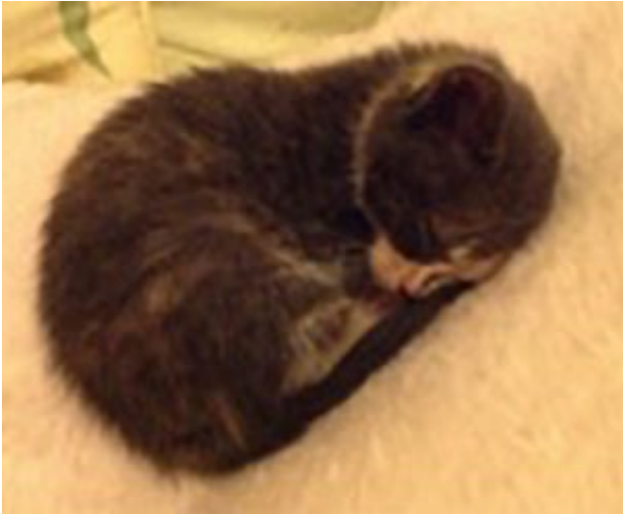
Fig 1.9 Red Ragdoll cross kitten £300