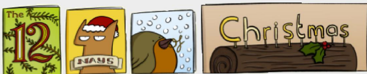
Illustration: Rus Hudda

Christmas is on its way and the arrival of trees, guests and fancy food will all have an impact on your cat. Cats Protection suggests the following tips to make sure your pet's festive season is a safe and happy one: