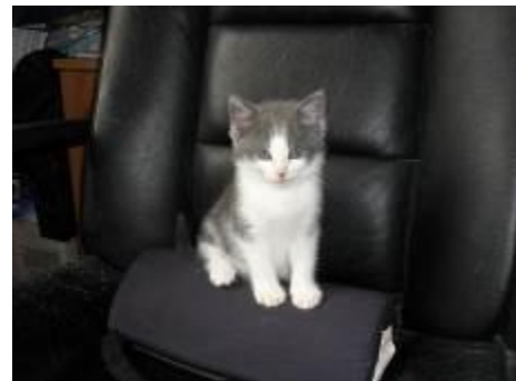
Twizzle & Smartie