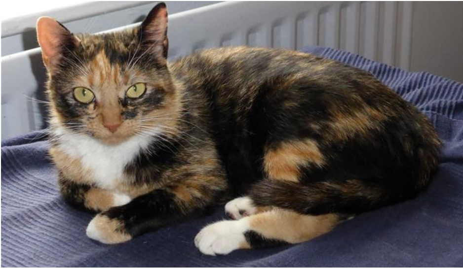
Rosa, sweet, playful and looking for fun, needs to be the only cat in a house.