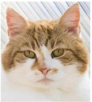
Duke, ginger & white, about 5yrs old

Duke and Charles came into CP care as strays and will be homed together as they are pals. Having been independent for some time they are a little shy of people but when they get used to you they relax and they are quite happy to be with you. They need someone who is used to cats and can give them all the time they need.