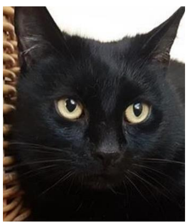
Charles, black, approx. 8yrs old

Both male, Duke and Ginger formed a bond together while being looked after temporarily by their finder who wanted them to have a chance of a new home and all the love and cuddles they deserve. They would be ideal for a mature family or single person household where they can be encouraged to come around in their own time and feel safe. They will like to have access to a secure garden, quiet location, after an extended settling in period. If you feel you can give these two lads their forever home, then give CP a ring today - you won't be disappointed.