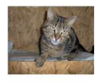
Lola – 1 yr female Tom – 2 yr old male

If you are interested in giving one of these cats a new home, please contact us on 01557 339233 to arrange a home visit. All adult cats are neutered, vaccinated and microchipped. Please note we have an adoption fee of £25 per cat. More details about the cats can be found on our website www.stewartry.cats.org.uk