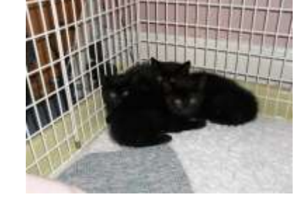
The log barn, after the kitten hunt