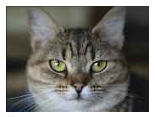
Flower is 2 years old and has had a few changes of circumstances. She is friendly and would be happiest in a home without small children and with an experienced cat owner, who would give her the time to build up trust and regain her confidence and blossom.

PJ was abandoned and had been living as a stray for a while. He was found lame with infected bite wounds and had been walking on 3 legs for some time. PJ is a real softie, he is friendly and very laid back and would love for someone to give him the chance to be happy in a loving home.