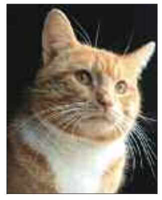
Hutch is under 2 years old and turned up as an unneutered stray with a foot injury. He has a great personality and is curious and playful. He is now looking for a home that he can call his own.