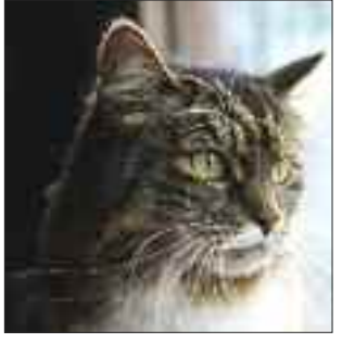
Jess is a young female who has had a rough start to life. She came in as a victim of cruelty case as she was thrown out of a block of flats. She is friendly and is looking for somebody patient and understanding who will give her time to settle in a home where she can have the attention she deserves.

Tosca is a stunning 8 year old who needs a new home due to her owners change in circumstances. She is very, very vocal! She loves rolling on her back and playing with drinking straws. Tosca is a family cat, she is used to children of all ages and tolerates other cats but not dogs.