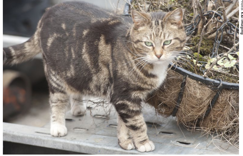
We helped Adam Bownass with the cost of neutering more than 40 cats

Our National Black Cat Day celebrated darker felines