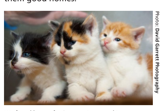
We found homes for Scrappy, Dusty and Rusty

In November, workers at an Ipswich landfill site spotted three tiny kittens among the household rubbish. Our Ipswich Branch cared for traumatised Scrappy, Dusty and Rusty and found them good homes.