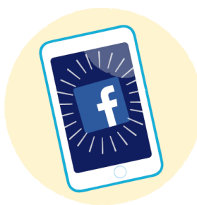
Stream a skill