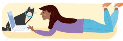
Netflix watch party