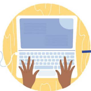
Use the internet