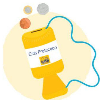
Virtual bucket collection