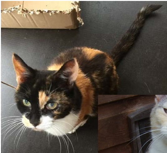
Smudge (above) Poppy (right)