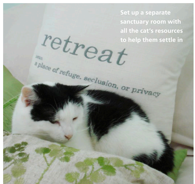
Set up a separate sanctuary room with all the cat's resources to help them settle in

If you have problems, please seek help sooner rather than later as it may be easier to resolve a recently developed problem than one which has existed for some time. If cats have been introduced too quickly, you may need to give them separate rooms and start the introduction process from scratch. Speak with your vet for further advice who may recommend referral to a suitably qualified behaviourist, such as a member of the Association of Pet Behaviour Counsellors ( www.apbc.org.uk ). ●