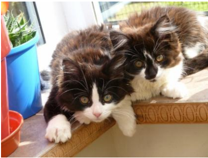
Guinness & Feather