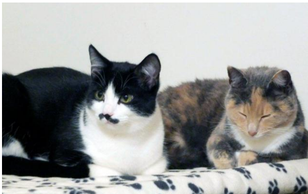
Tash & Kit

Last year we took in 2 young farm kittens from a property that was being repossessed. Sadly, one of the kittens was quite poorly and failed to thrive, despite the care of the vets and the fosterer. However, the other kitten 'Tash' went from strength to strength and grew into a lively, loving boy. He was in our care for many months as we didn't have anyone interested in adopting him. When he was about 9 – 10 months old, he was adopted by a couple that had previously adopted a cat called Kit. They have 2 dogs and we weren't sure if Tash would get on with dogs but thanks to the new owners taking the introduction slowly, cats and dogs get on famously – as you can see below.